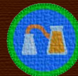
Cold Soak Filtration