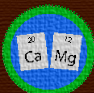
Calcium and Magnesium