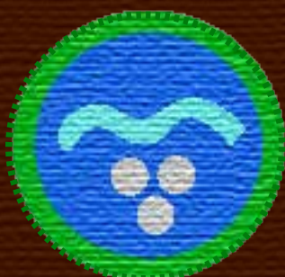
Water and Sediment