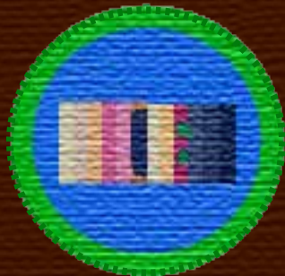
Copper Strip Corrosion