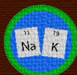
Sodium and Potassium