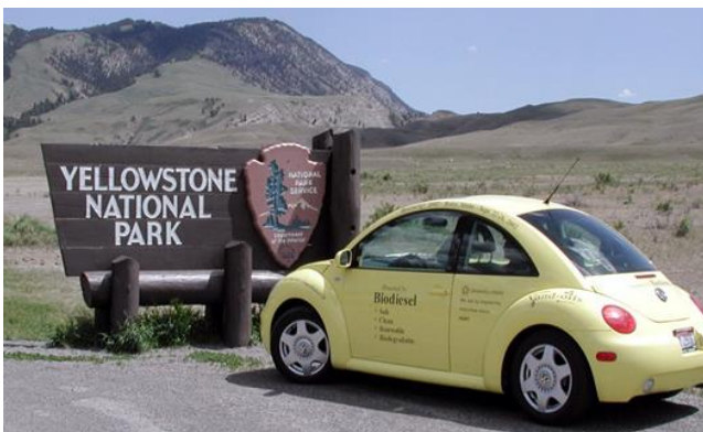
The University of Idaho introduced biodiesel into Yellowstone National Park in 1995. Influenced by Yellowstone’s success, all national parks now use biodiesel blends in their fleets.

The University of Idaho introduced biodiesel into Yellowstone National Park in 1995, which was the first national park to use biodiesel. A 4-wheel drive Dodge running on B100 made at the University was used to kick-off the “Truck-in-the-Park” project. Within a few years, the park decided to use B20 in all its vehicles. Influenced by Yellowstone’s success, all national parks now use biodiesel blends in their fleets.